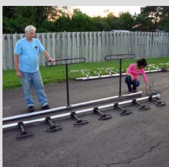
Feed cable through bottom mast