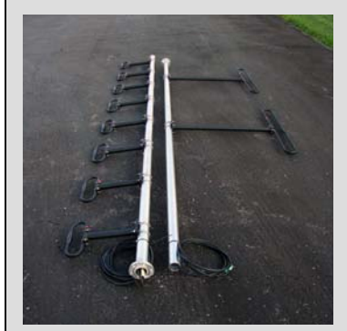
Antenna arrives in 2 sections