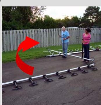
Swing base section out, align, bolt flanges together and erect.